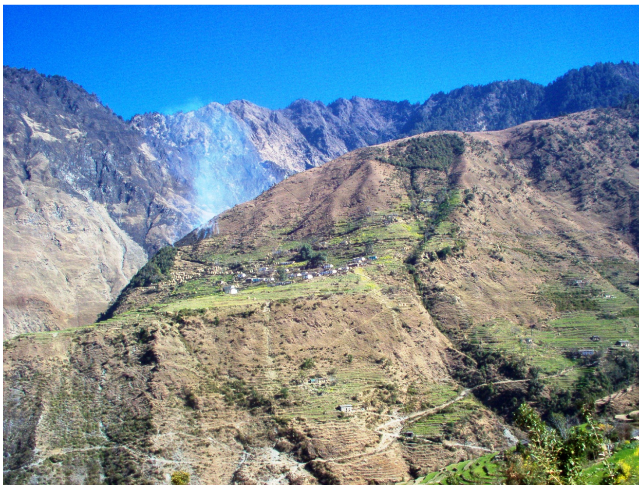
Figure 1 Study site: Khar VDC, Darchula district.

Four field surveys were carried out during different seasons of the year (May, December 2006, February 2007, March-April 2008). Each survey lasted over 20 days in the field. Primary data collection, after establishing oral