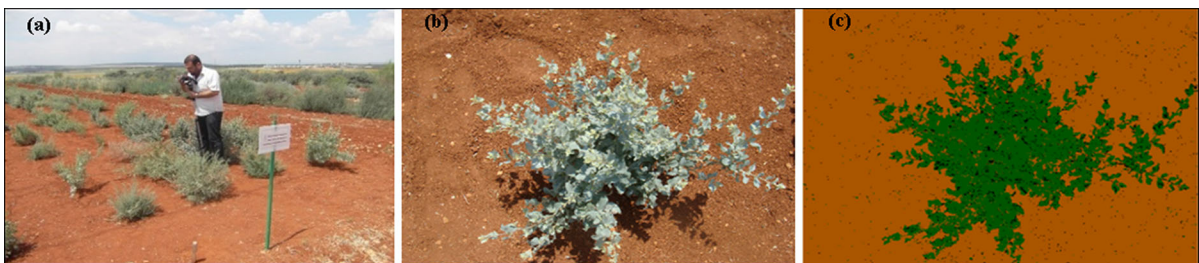
Fig. 1 Estimation of shrub canopy cover using a digital camera mounted on a monopod 1.5 m above the ground: a image collection with the equipment, b natural image of a shrub plant

on the ground and c extracted image of the canopy coverage from the digital image using image processing VegMeasure program