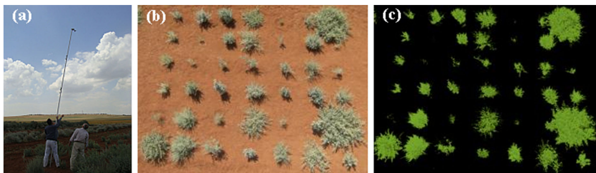
Fig. 2 Estimation of shrub canopy cover using a digital camera mounted on a monopod 6 m above the ground: a image collection with the equipment, b natural image of the shrub

community on the ground and c extracted image of the canopy coverage of the shrub community from the digital image using image processing VegMeasure program