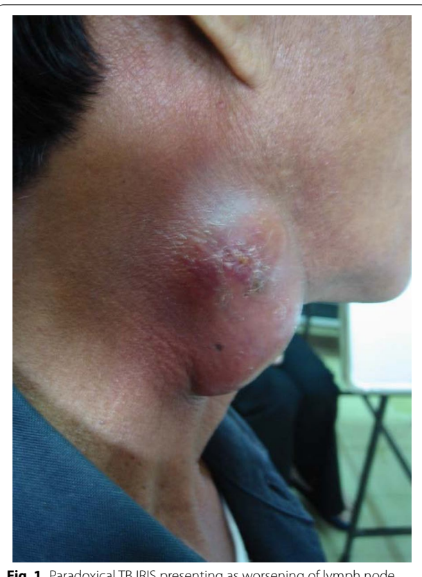
Fig. 1 Paradoxical TB IRIS presenting as worsening of lymph node enlargement

Three major factors involve the pathogenesis of TB-IRIS, including (1) mycobacterial antigen burden and anti-TB treatment, (2) immune system function of the patients, and (3) ART initiation and potency. The role of mycobacterial antigen burden is suggested by the risk of TB IRIS that is greater in the patients with earlier ART initiation during TB treatment when the residual mycobacterial load remains high and in those with disseminated TB [124, 130]. Mycobacterial antigen releasing from the killing bacilli with TB treatment stimulates an exuberant inflammatory response. The host immune system also plays roles in the pathogenesis of TB IRIS. Pre-existing immune deficiency has been shown to predispose to TB IRIS. Many previous studies revealed that the low nadir CD4 cell counts have been related to subsequent IRIS [119, 131, 132]. High plasma HIV viral load has been reported to be associated with TB IRIS [133]. In addition, it is associated with an exuberant production of inflammatory cytokines, such as IFN-gamma [134, 135]. In terms of ART, not only the rate of CD4 cell count recovery in peripheral blood after ART initiation is associated with TB IRIS [115], but the ART may also trigger local immune reconstitution via increased numbers