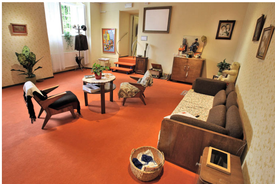
Fig. 4 View into the EuroVision Lab., co-curated by visitors, of the MNZS

visitors who were ready to explore them and to discover their trans-regional, trans-national, cross-cultural and European layers. The exhibition was enriched by an accompanying programme, which for example, offered guided tours in sign language.