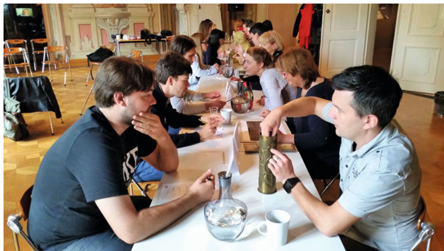
Fig. 3 Museum speed dating in the MNZS, photo: Urška Purg, National Museum of Contemporary History Slovenia

variety of activities with public appeal and also in different exhibitions. This implementation in all consortium members' institutions and further associated institutions can be regarded as a field test of the theoretical framework developed in the initial project phases. By applying the Toolkits the participating museums take a step towards further europeanization and also gather valuable experience on the practicability of the EMEE ideas and concepts. At this juncture the EMEE EuroVision Lab. is still in the start-up phase. Two museums have opened their EuroVision Lab.s: the Muzej Novejše Zgodovine Slovenije [National Museum of Contemporary History Slovenia, MNZS], which is an EMEE consortium member, and the Museum für Kunst und Kulturgeschichte Dortmund [Museum of Art and Cultural History Dortmund, MKK] in Germany, which is a museum associated with EMEE. Both museums prepared an exhibition using participatory technologies.