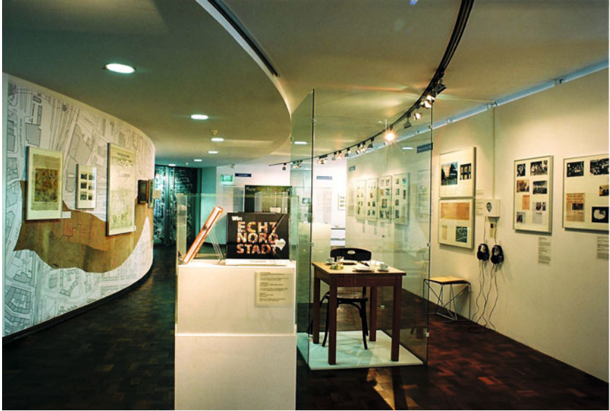
Fig. 5 View into the EuroVision Lab., co-curated by citizens of Dortmund, of the MKK, photo: Museum für Kunst und Kulturgeschichte Dortmund, Madeleine-Annette Albrecht

raised for decades. The imbalance of power between visitors and museum experts is a vivid field for discussion and representatives of new museology have spoken out in favour of including museum communities and audience participation which allows a critical debate on mono-perspectivism along with elitism and exclusionary practices since the 1980s (Carpentier 2014). Finding a new professional identity as museum expert is a process that is not without pressure and assessing the audiences in respect of co-curators needs is not easy: “Those arguing for constructing the visitor as relatively ignorant were accused of being ‘patronizing’ and of ‘dumbing down’, those who constructed the visitor as more educated faced charges of ‘elitism’ and of being potentially ‘exclusionary’” (Macdonald 2001, 133). Balancing the relationship between audiences and museum experts therefore depends on knowing the audiences and on building long-term relationships. Carpentier describes a participatory fantasy: