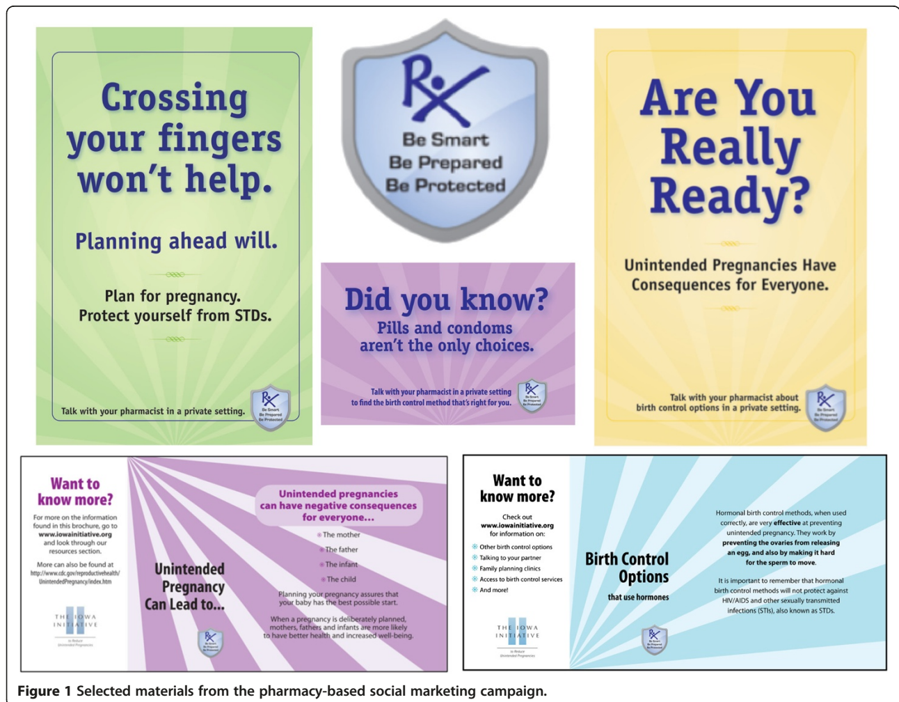
Figure 1 Selected materials from the pharmacy-based social marketing campaign.