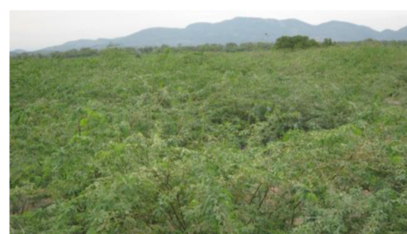
Fig. 3 P. juliflora encroachment at Bedlu-Ale grazing land, Middle Awash area

pastoralists' sustained existence (Chambers and Conway 1991). As the scale of encroachment of invasive species increases, its effect on the supply of ecosystem goods and livelihood activities also increases (Siges et al. 2005; Gemedo et al. 2006; Shackleton et al. 2006; Angassa and Oba 2008). In the Middle Awash area, majority of the households perceived that more than half of their grazing land is occupied by P. juliflora . During the survey, I also realized that a significant proportion of grazing lands were already encroached by the plant as shown in Fig. 3. The invasion forms impermeable, dense thickets, reducing grass cover of grazing lands. Despite this, it was the extended fodder/forage source areas which would guarantee the existence of pastoralism in their fragile ecosystem.