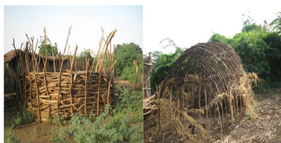
Fig. 2 Small stock barn and traditional Afar thatch house frame made from P. juliflora in the Middle Awash area

Durfu ( Chrysopogon plumulosus ), isissu ( Cymbopogon pospischilii ), melif ( Andropogon canaliculatus ), denkito