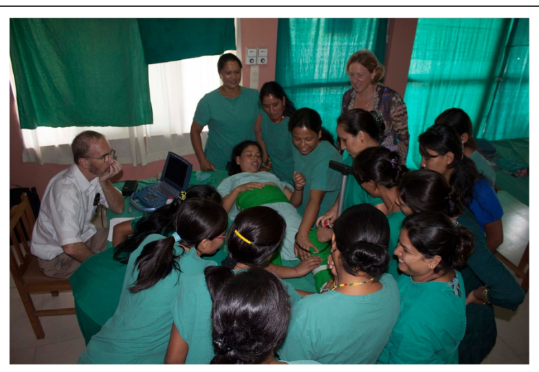
Figure 2 Class demonstration of device application with nurses and midwives.

The study enrolled 58 participants including nurses and midwives in Kavre and neighboring districts, who represented a cross-section of non-physician skilled birth attendants. Midwives were recruited from a variety of small health facilities including sub-health posts. Many came from rural areas that were up to a two days' walk from the nearest road. We attempted to include representatives from the various kinds of facilities available to pregnant women in Nepal. Inclusion criteria were all active midwives and all nurses who had completed Skilled Birth Attendant (SBA) training and were hence eligible to provide midwifery services. Participants were randomly selected by name from all the 344 primary health posts,