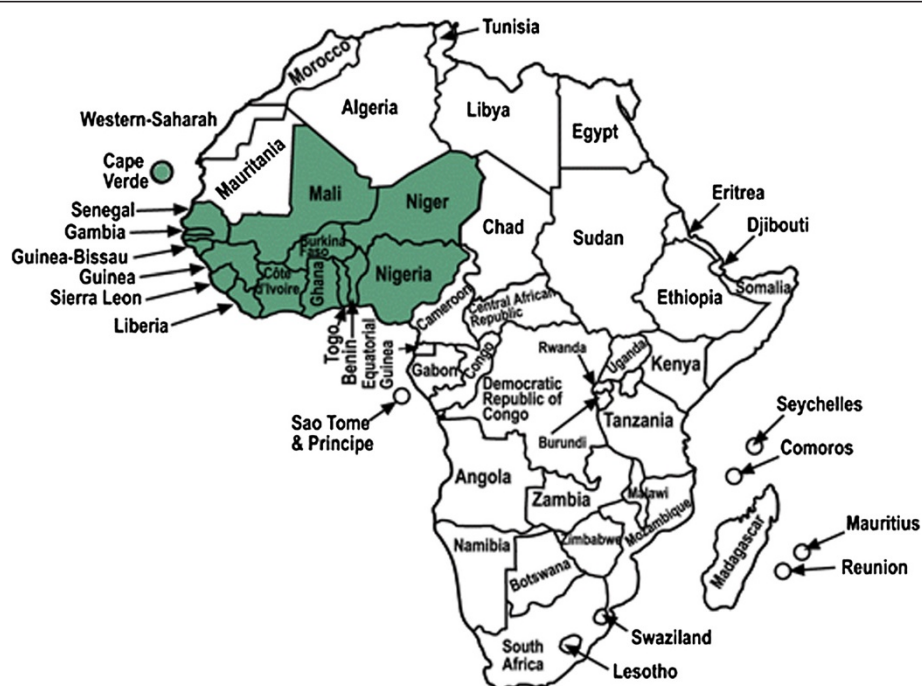
Figure 1 Western Africa: Economic Community of Western African States (ECOWAS) Countries: Benin, Burkina Faso, Cape Verde, Cote d'Ivoire, Gambia, Ghana, Guinea, Guinea-Bissau, Liberia, Mali, Niger, Nigeria, Senegal, Sierra Leone and Togo.

First, the need to urgently recognise and coordinate outbreak action-responses in affected African countries and in cross-border neighbours, as well as collaboration with those that experienced outbreaks in the past, is vital.