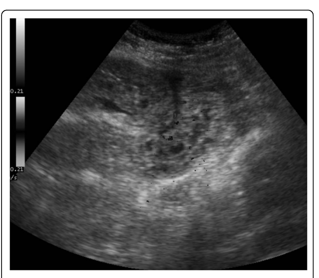
Figure 4 Intraperitoneal free fluid and/or reduced intestinal peristalsis at sonographic examination are considered indirect signs of gastroduodenal perforation.

indirect signs of gastroduodenal perforation (Figure 4). Ultrasonography could help to confirm intestinal paresis and the evidence of intraperitoneal free fluid [26].