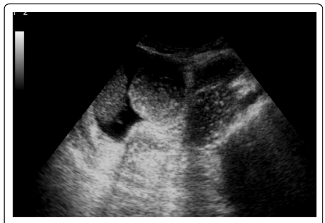
Figure 3 Meticulous examination focused on the patient problem may yield a causative diagnosis of peritonitis due to perforated gastric or duodenal ulcer, perforated appendicitis o diverticulitis, suggested on the basis of wall thickening, fluid accumulation, inflammatory mass, thickening of the gallbladder, hyperechogenicity of the right anterior extrarenal tissue (renal rind sign) and free intraperitoneal gas confined to the fissure for ligamentum teres.

Intraperitoneal free fluid and/or reduced intestinal peristalsis at sonographic examination are considered