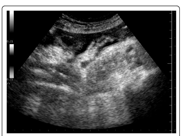
Figure 2 Direct sign, such localized gas collections related to bowel perforations, may be detectable, particularly if they are associated with other sonographic abnormalities, called indirect signs (thickened bowel loop and air bubbles in ascitic fluid or in a localized fluid collection, bowel or gallbladder thickened wall associated with decreased bowel motility or ileus).

Patient should be first scanned in the supine position concentrating on the midline and right upper quadrant, then in the left lateral decubitus and prone position [5,12], although it seems impractical for uncooperative, distressed patients or acutely ill patients, who often have an ileus [8].