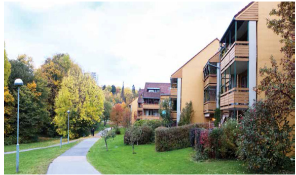
Fig. 2 Nedre Silkestrå Borettslag, Oslo, the housing cooperative under study.