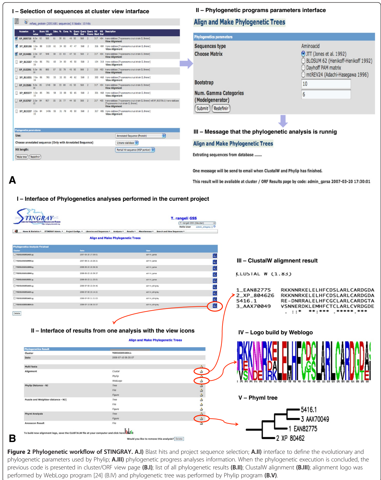
Figure 2 Phylogenetic workflow of STINGRAY. A.I) Blast hits and project sequence selection; A.II) interface to define the evolutionary and phylogenetic parameters used by Phylip; A.III) phylogenetic progress analyses information. When the phylogenetic execution is concluded, the previous code is presented in cluster/ORF view page ( B.I ); list of all phylogenetic results ( B.II ); ClustalW alignment ( B.III ); alignment logo was performed by WebLogo program [24] ( B.IV ) and phylogenetic tree was performed by Phylip program ( B.V ).