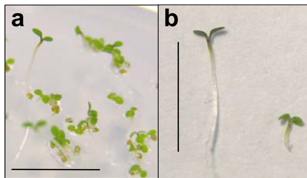
Figure 4 Rapid selection of hygromycin B-resistant Arabidopsis thaliana Col-0 seedlings. a. Seedlings from Arabidopsis thaliana Col-0 T1 seed obtained from plants subjected to floral dip transformation using Agrobacterium tumefaciens strain GV3101 harbouring the binary plasmid pBIG-HYG. Seeds were plated on 1% agar containing MS medium (including vitamins) and hygromycin B at a concentration of 15 \mu\text{g ml}^{-1} . Following a stratification period of 2 d at 4°C in the dark, seedlings were incubated for 6 h at 22°C in white light, followed by incubation at 22°C in the dark for 2 d and continuous white light for a further 24 h. b. Hygromycin B-resistant Arabidopsis seedling after rapid selection procedure (left); kanamycin-susceptible seedling after rapid selection procedure (right). Size bars 1 cm.