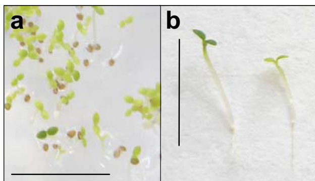
Figure 3 Rapid selection of phosphinothricin-resistant Arabidopsis thaliana Ws seedlings. a. Seedlings from Arabidopsis thaliana Ws T1 seed obtained from plants subjected to floral dip transformation using Agrobacterium tumefaciens strain GV3101 harbouring the binary plasmid pSKI015. Seeds were plated on 1% agar containing MS medium (including vitamins) and phosphinothricin at a concentration of 50 \mu\text{M} . Following a stratification period of 2 d at 4°C in the dark, seedlings were incubated for 6 h at 22°C in white light, followed by incubation at 22°C in the dark for 2 d and continuous white light for a further 24 h. b. Phosphinothricin-resistant Arabidopsis seedling after rapid selection procedure (left); phosphinothricin-susceptible seedling after rapid selection procedure (right). Size bars 1 cm.

To confirm the phenotypes of seedlings grown in the presence of hygromycin B, wild-type controls were grown alongside previously characterised hygromycin-resistant lines obtained following transformation with pBIG-HYG [8] which confers hygromycin B resistance via the hpt