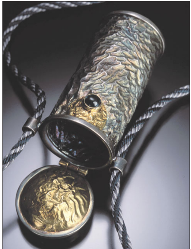
Figure 4 Reticulated 18 carat gold locket by Ann Larsen Hollerbach

Reticulation is the art of producing a rippled and ridged surface texture on alloys. The alloy most commonly used is 80% silver and 20% copper although other silver alloys and some carat gold alloys can be reticulated. The technique is to