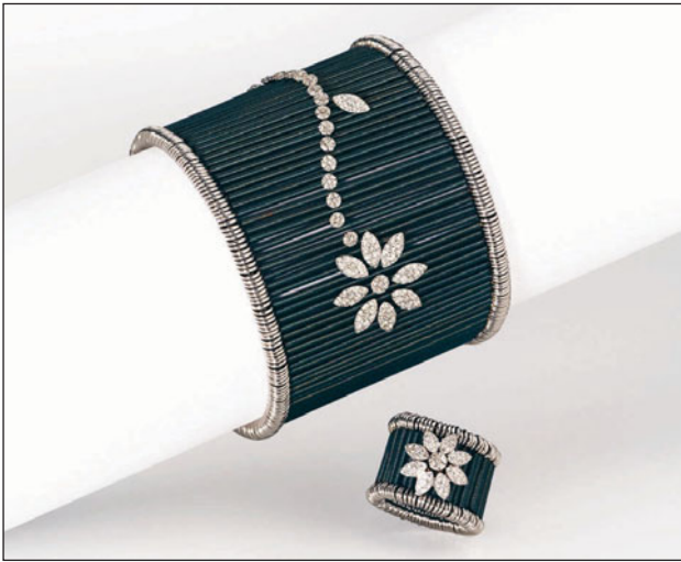
Figure 2 Blue Gold jewellery by Jarrettiere, Italy