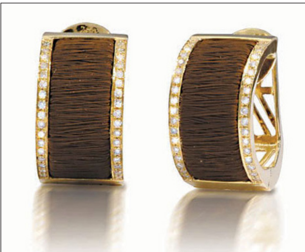
Figure 3 Brown gold jewellery by Yvel, Israel

Conventional carat gold jewellery can be produced with colours in different shades of red, yellow, green and white depending on the alloy composition. It is possible also to obtain special colours such as blue, black and purple by alloying gold with other metals to produce intermetallic compounds at fixed compositions. The best known examples are ‘purple gold’, which is based on the compound AuAl_2 at about 79 wt.% Au – 21 wt.%Al, and the ice-blue gold-indium compound AuIn_2 at 46 wt.% Au. These compounds are inherently brittle and cannot be worked. Consequently, their uses in jewellery are limited although Dr. Corti discussed some methods for overcoming this problem. Other approaches are to produce coloured coatings onto gold jewellery by electroplating, oxidation, chemical vapour deposition and patination and examples were given of these techniques.