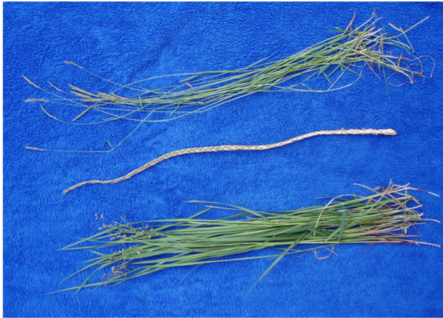
Fig. 3 A scented grass braid (middle) compared to the main sources of suitable plant material available in northern Norway: Anthoxanthum nipponicum (at top), where only the culms are of suitable length, and Hierochloë odorata , with long, flexible leaves that provide the necessary material for braiding (bottom). Photograph: Torbjørn Alm 2006

Norway, as shown by the voucher specimen (in TROM) of Ove Arbo Høeg's record from Forsand in Rogaland (NFS 184).