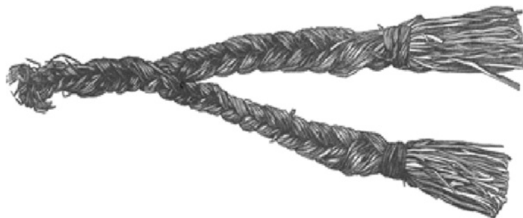
Fig. 1 A North Sámi braid of scented grass as depicted by F.C. Schübeler in 1886 ([2]: 259), wrongly identified as deriving from Anthoxanthum odoratum L.

(1–2) Anthoxanthum , with two species, A. odoratum L. and A. nipponicum Honda (syn. A. alpinum Á. & D.Löve, A. odoratum L. ssp. alpinum (Á. & D.Löve) B.M.G.Jones & Melderis). Both are rather small, usually some 20 to 30 cm tall, and look very similar to the untrained eye. Spikes are usually denser in A. odoratum , and distinctly pubescent, with scattered hairs on the pedicels. The interior glumes are covered with tiny spikes, and thus appear dull. A. nipponicum is almost glabrous, with shiny glumes. In Norway, the two taxa