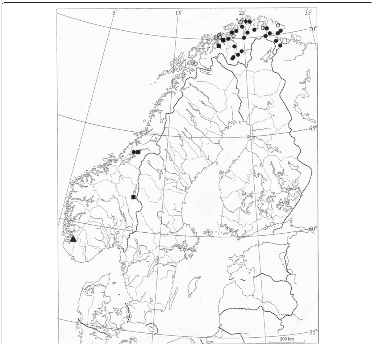
Fig. 4 Map showing the distribution within Norway of the «scented grass» tradition, and the grass species utilized: Anthoxanthum nipponicum (■), Anthoxanthum odoratum (▲), Hierochloë odorata (●), Miliium effusum (◆), and unidentified grasses, probably Hierochloë odorata (○)

Trøndelag, used for both Anthoxanthum and Hierochloë , and luftgrasbonk (“scent grass bundle”) from Engerdal in Hedmark, the latter supposedly for Anthoxanthum .