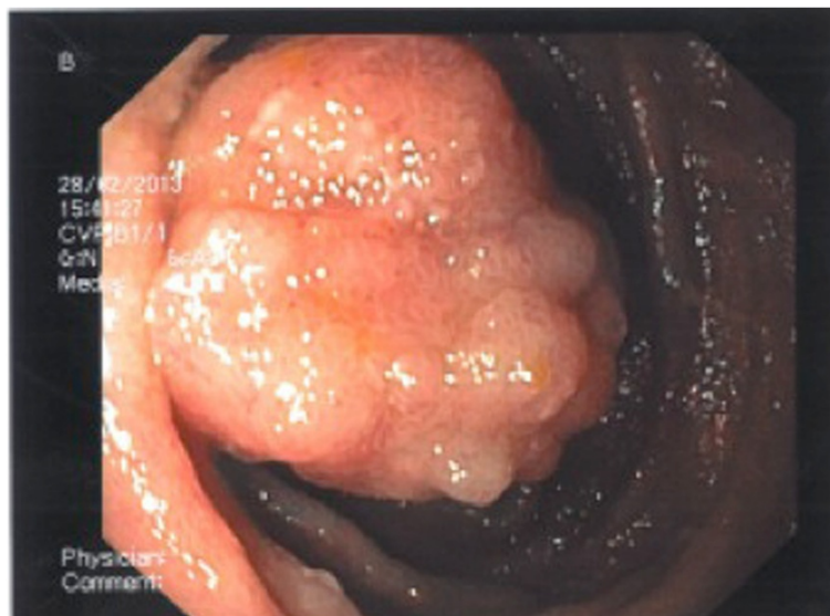
Figure 3 Peutz-Jeghers polyp found at endoscopy.