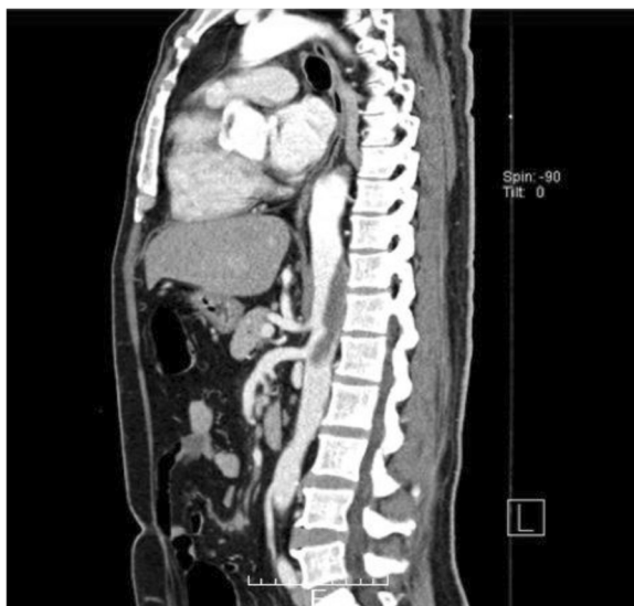
Fig. 3 Sagittal view of the preoperative contrast-enhanced computed tomography

Most arterial embolisms occur due to thrombi in the left side of the heart [1], and only a few reports describe systemic embolism without vascular disease such as aortic dissection, aneurysm, atrial fibrillation, congenital coagulopathy, or intracardiac shunt. We only found published cases in which systemic arterial embolism occurred