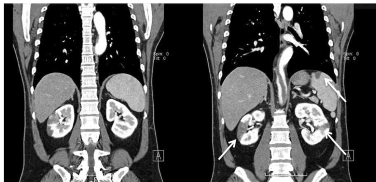
Fig. 1 Preoperative contrast-enhanced computed tomography. The computed tomography scan showed both the multiple renal and splenic infarctions (white arrows) and the large intra-aortic thrombus in the descending thoracic aorta

The operation was started with our patient in a right half-lateral position, and preparations for femoral arteriovenous extracorporeal circulation were completed. A thoracoabdominal spiral incision was performed, and