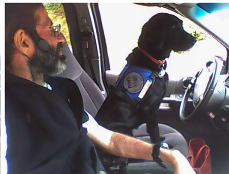
LHS: Bishop. RHS: Julep.