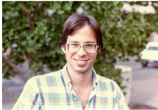
At Oberwolfach in 1983.

Assistant Professor in 1983, and was promoted unusually quickly to Associate and then Full Professor. He taught and did mathematics at Berkeley until his untimely death. He had 12 Ph.D. students, published 63 research papers, and received numerous honors and recognition for his work, including a MacArthur “Genius” Fellowship in 1987.