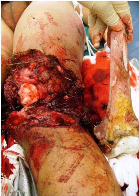
Fig. 1 Third-degree open, subtotal amputation at the lower third of the left femur with severe soft tissue contamination. The distal part of the femoral bone was brought separately to the ER

approximately 26 cm of the distal third of the left femur, no injury to the femoral artery but an injury to the femoral vein (Fig. 2). Clinical neurological examination was not possible. A decision for attempted limb salvage was made taking into consideration the patient's age and the absence of injury to the femoral artery. Within 1 h of ER admission, the patient was brought to the operating theatre and the hip dislocation reduced. A thorough debridement of all contaminated and necrotic soft tissue was then performed. The popliteal area was explored confirming no damage to the popliteal artery and nerve. Surgical repair of the femoral vein was performed by a vascular surgeon. The distal part of the femur and proximal part of the tibia were shortened and connected with a k-wire and bone cement spacer (Palacos ® , Zimmer) with gentamicin added, creating a solid interposition construct (Fig. 3). A complete fasciotomy was performed and a synthetic skin replacement (Epigard ® , Consept GmbH) as temporary wound dressing applied. In addition, a spanning external fixator was mounted for skeletal stabilization of the limb.