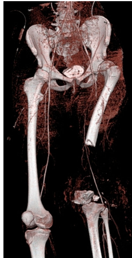
Fig. 2 Computed tomography (CT) angiography demonstrates a complete dislocation of the left hip, segmental bone defect of approximately 26 cm of the distal femoral bone without signs of injury to the popliteal artery

Anteroposterior and lateral radiographs after surgery revealed an appropriate position for the bone cement spacer. The Epigard cover was changed every 2 days until the wound was clean and able to be covered by meshed skin grafting (Fig. 3). A long-cassette radiograph and clinical evaluation revealed a limb length difference of 10 cm with the bone cement spacer in situ. Bifocal bone lengthening of both the femur and tibia was planned due to the total length of the bone defect. A mono-lateral external