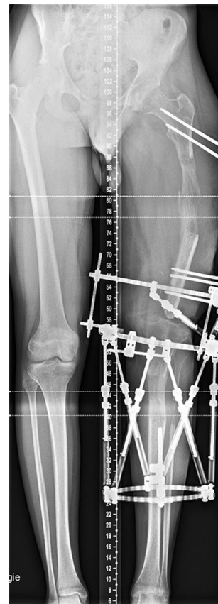
Fig. 4 Radiological findings 250 days after injury preoperatively before nailing procedure

The debate continues over to perform primary amputation or limb salvage in a high-energy, complex open fracture with extensive bone defect in the lower extremities [3]. Both strategies have advantages and disadvantages. Aside the functional loss, body image and mental health issues after primary amputation surgery, patients can be at risk for