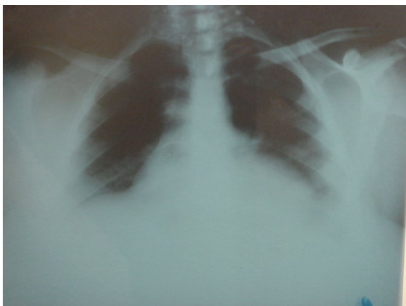
Figure 2 Plain chest X-ray shows no pleural effusion or metastasis. Upward displacement of the diaphragm affecting air entry into the lower lobes of lungs (explains patient's tachypnea).