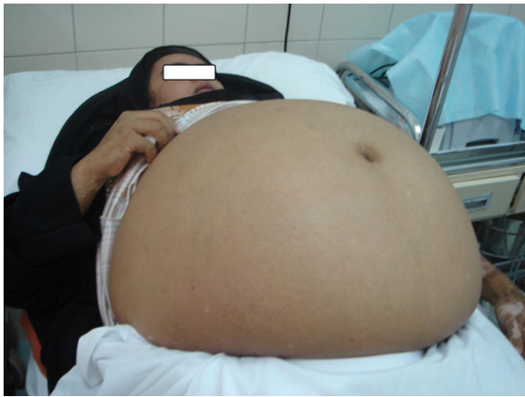
Figure 1 A giant pelvi-abdominal mass noticed on abdominal examination.

xiphisternum, to deliver the cystic mass intact without exposed it to the risk of rupture intraperitoneally. The outer surface of the mass was smooth and intact all-around without external growths or adhesions. The uterus, right adnexa, and appendix were looking healthy. No ascites or enlarged para-aortic lymph nodes were discovered. Left salpingo-oophorectomy was performed as the whole ovary was involved in the mass and the left tube was abnormally dilated and adherent to the mass (Figure 3). The size of the tumour was 42 \times 28 \times 25 cm with 7,250 kg in weight. Microscopic examination revealed a cyst lined by a single layer of non-ciliated columnar epithelium without stromal invasion, the picture of which is compatible with mucinous cystadenoma (Figure 4). Postoperative recovery was uneventful and the patient was discharged on the 5 th postoperative day to be followed-up every 3 months.