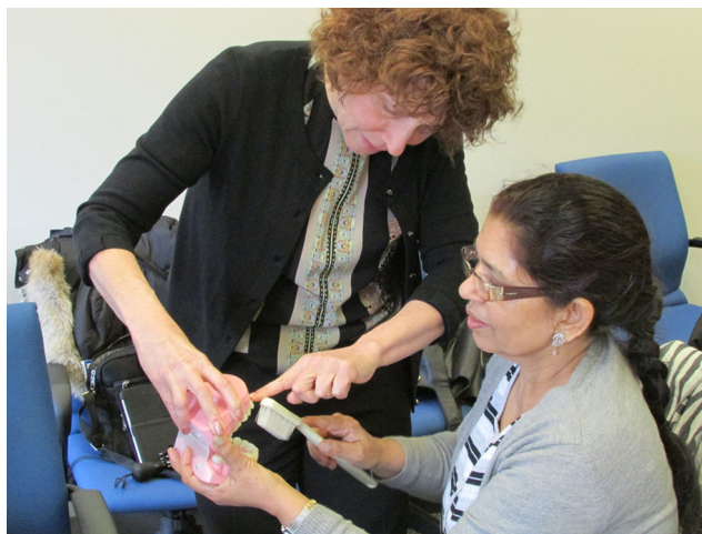
Fig. 2 | A dental hygiene faculty member demonstrates proper tooth brushing with fluoride toothpaste technique to a Sikh community educator using a model

subsequently implemented in five Gurdwaras over 2 years, with workshops held every other week. Due to difficulties in coordinating schedules between the community educator and her participants, only one session was conducted at the sixth Gurdwara.