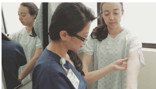
Fig. 2 Pre-phototherapy skin inspection

affected areas on the arms and legs compared to the face and trunk. In some cases in which the patient has psoriasis lesions on the lower legs, the patient may be asked to stand on a step stool to allow for a greater amount of light to reach the lower legs. After treatment, the patient steps out of the UVB box and returns to the dressing room where the nurse offers to apply lotion to hard-to-reach areas such as the back, and gives the patient extra lotion to moisturize the rest of his/her skin. Following this, the patient can get dressed and the treatment session is complete.