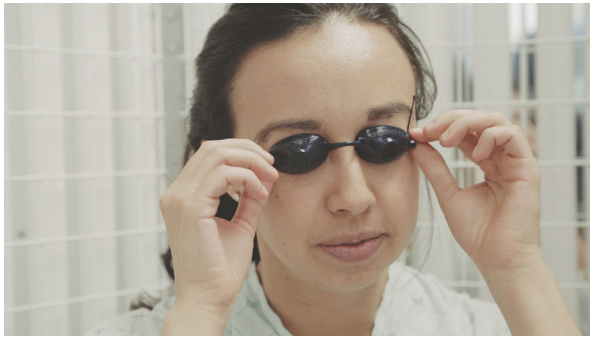
Fig. 1 UVB eye protection

been shown that UV light does not penetrate the eyelids [19]. A towel is also generally wrapped around the face if the skin condition is not present there. Finally, genital coverage is required of all male patients unless an exception has been approved by a physician. NB-UVB is also safe for use in pregnancy [20, 21].