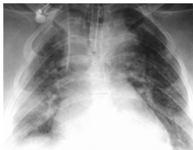
Chest radiography upon arrival displayed signs of pneumonia, for example, in the right lower lobe.