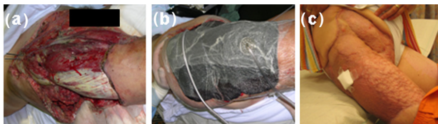
Wound management via vacuum-assisted closure therapy. (a) Large-scale tissue damage at hip and upper lower extremity. (b) Vacuum-assisted closure therapy. (c) Successful skin grafting.