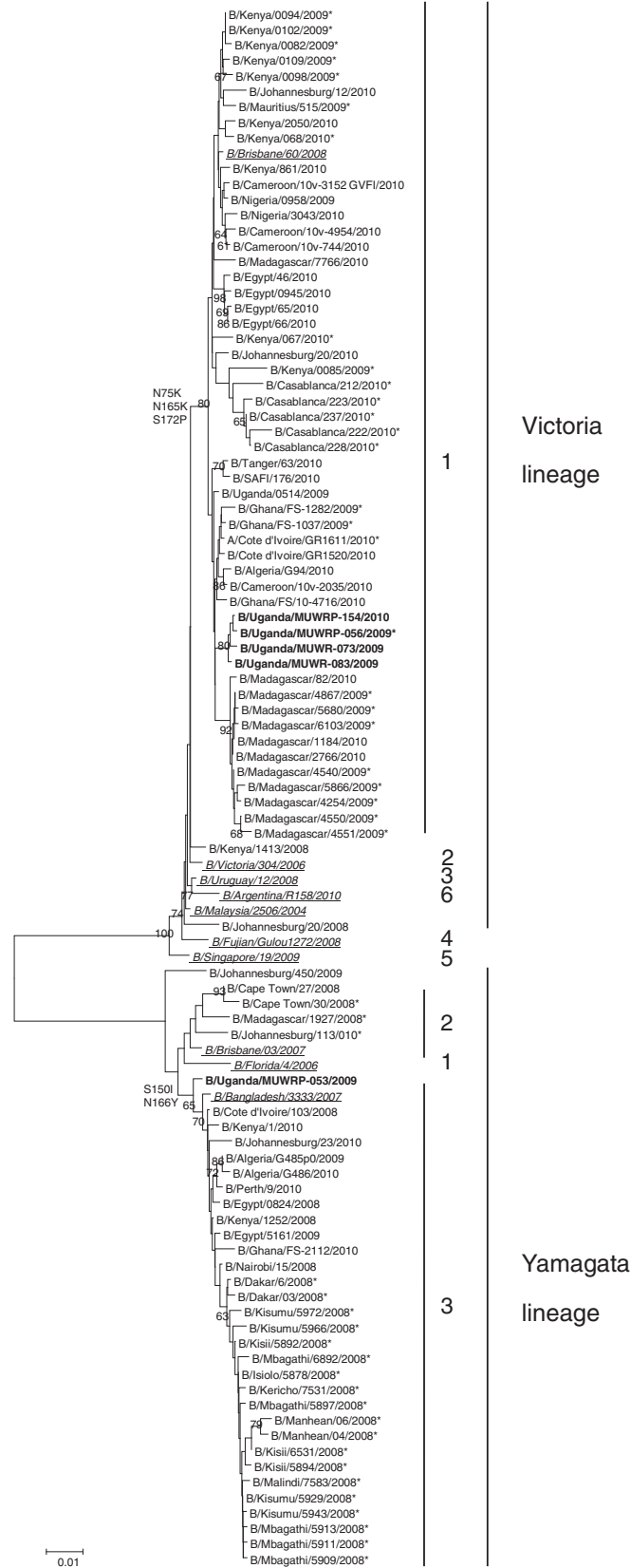
Figure 1 (See legend on next page.)