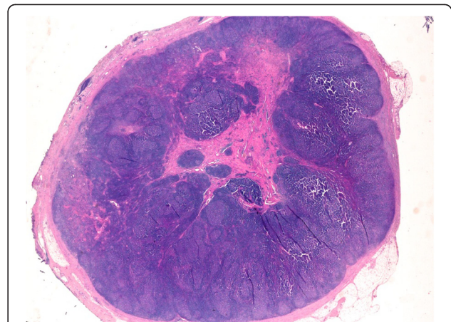
Figure 2 Low-magnification image of lymph node affected by angiomatous hamartoma. The hilar region is replaced by a dense eosinophilic tissue, leaving a residual rime of cortical lymphoid tissue. Note the striking contrast between the central area and the normal peripheral tissue. Original magnification, x 5; hematoxylin-eosin stain.

appeared as smooth muscle fibers, as confirmed by their positivity for HHF35 and desmin. Consecutive sections did not document presence of a cystic lesion. All the aforementioned findings were consistent with a pathological diagnosis of AH of the lymph node.