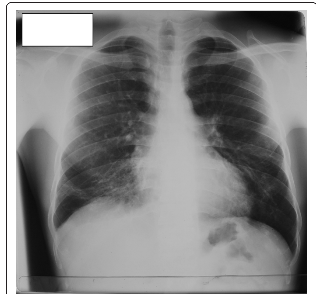
Figure 1 Chest roentgenogram from our patient. Features of previous pulmonary tuberculosis can be seen.

Anti-TB therapy was started immediately and continued for six months (isoniazid, rifampicin, pyrazinamide and ethambutol combination for two months plus isoniazid,