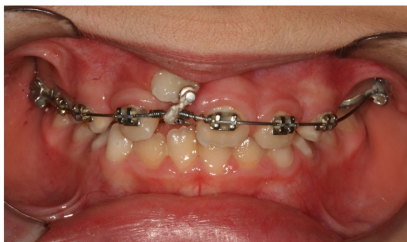
Figure 5 Expansion spring being positioned.