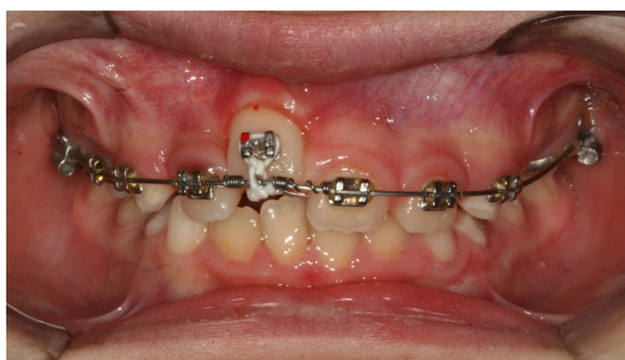
Figure 6 Tooth has almost reached the correct eruption zone.

To check if there had been a loss of tooth osseous support, periodontal probing of her two central upper incisors was performed. We compared the measurements to establish whether her right incisor had received any periodontal damage during traction. With a healthy periodontium, the distance between the gingival margin and the underlying bone should not exceed 3mm. When periodontal disease develops, there is a loss in the tooth bony support that partially or totally involves the root.