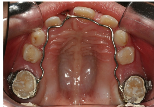
Figure 3 Splint being cemented. Occlusal intraoral photo.

age-appropriate, except for the absence of her central upper right incisor. The probable cause of the lack of eruption of her incisor was connected to a traumatic event that occurred during her childhood. As reported in her anamnesis, she fell at approximately 2 years of age. This trauma caused the impaction of her deciduous upper central right incisor, producing a delay in the formation of the corresponding permanent tooth and subsequent impaction. No pathologies or situations that may cause eruption anomalies were noted from her family or medical history.