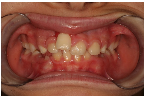
Figure 9 Final intraoral photo.

The resulting “periodontal pocket”, or deepening of the gingival sulcus, is defined as pathological when the loss of attachment exceeds 4 to 5mm. A graduated periodontal probe, with a 0.5mm-diameter rounded tip and a colored area extending from 3.5 to 5.5mm, was used for probing. All her teeth and all levels (mesio-buccal, center-buccal, disto-buccal, mesio-palatal, center-palatal, disto-palatal) were probed. The probe was gently inserted in the tooth-gingival sulcus, with a force of about 25 to 30g, held parallel to the apical surface, and moved along the tooth surface until resistance was encountered. The probing depth was read on the probe, using the height of the colored area with respect to the gingival margin as a reference [7-9].