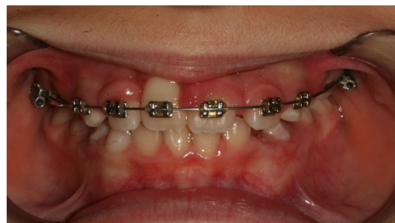
Figure 7 Tooth has reached its physiological position.

device, and a period of functional orthodontics to improve the shape of her arches.