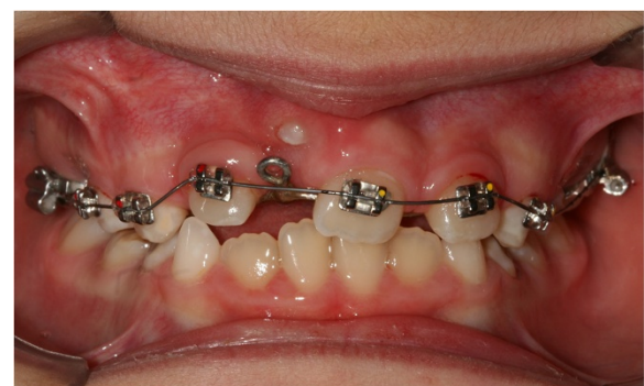
Figure 4 Banding of the upper arch.

To determine an adequate treatment plan, a panoramic radiograph of her arches and a projection telero-diograph of her cranium in the latero-lateral position were needed for cephalometric evaluations. The panoramic radiograph confirmed the suspected diagnosis; her upper right central incisor was impacted, the incisor radicular apex was closed, and the tooth was unable to erupt (Figure 1). A combined surgical-orthodontic treatment was selected, which included surgical exposure in the proximity of the impacted incisor, traction of her impacted incisor into the dental arch using an anchorage