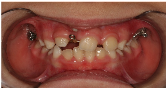
Figure 2 Splint being cemented. Intraoral photo.

Here, we describe the case of an 8-year-old Caucasian girl, in the mixed dentition period. An extraoral examination did not reveal facial asymmetry. Intraoral examination showed that her dental development was