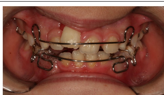
Figure 8 Functional orthodontics.