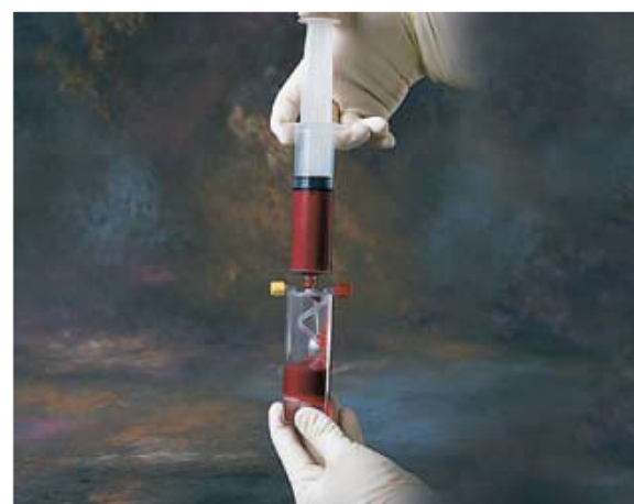
Fig. 2 Inserting bone marrow aspirate into the device. Insert the bone marrow aspirate into the Marrow Stim device, before putting it in the centrifuge

Experienced foot and/or ankle or trauma orthopaedic surgeons will perform the surgeries of both groups,