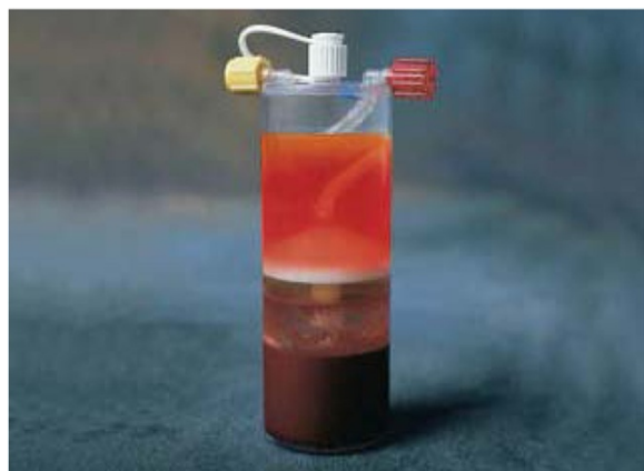
Fig. 3 Bone Marrow Aspirate after centrifuging. Bone marrow aspirate after centrifuging (cBMA) with: upper layer = cell poor plasma; middle layer = nucleated cell concentrate; lowest layer = red blood cells

within 2 weeks after inclusion. In brief, the proximal fifth metatarsal stress fracture will be approached and a decortication along the fracture lines will be performed. Part of this material will serve as a bone biopsy and is sent for histological examination. The stress fracture will be internally fixated, with use of a cannulated intramedullary compression screw. The remaining material from the decortication will be used as an internal bone graft. The patients in the intervention group only will receive the cBMA mixed with 2 ml untreated autologous peripheral blood (cB + cBMA), together with the internal bone graft and serving as a natural scaffold; it will be put into and around the fracture. Of the 6 ml cB + cBMA obtained, 4 ml will be added to the fracture site the other 2 ml is used for analysis.