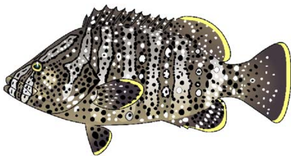
Fig. 1 The Leather bass, Dermatolepis dermatolepis . Drawing by LG Allen

Galapagos Islands, and Cocos Island (Allen and Robertson 1994; Grove and Lavenberg 1997; Garrison 2000). The reproductive patterns of Leather Bass are poorly understood; however, adults are reported to form spawning aggregations of fifty or more individuals (Aburto-Oropeza and Hull 2008). Also, spawning was recorded in July 1995 in the film “Secrets of the Ocean Realm: Creatures of Darkness” (Howard Hall productions, ©MMVII Questar, Inc.) at Isla Manuelita, a small island located a few hundred meters off the northern coast of Cocos Island, Costa Rica. Here we provide the first detailed descriptions of courtship and spawning behavior in the Leather Bass from observations made from a manned-submersible at a seamount near Cocos Island.