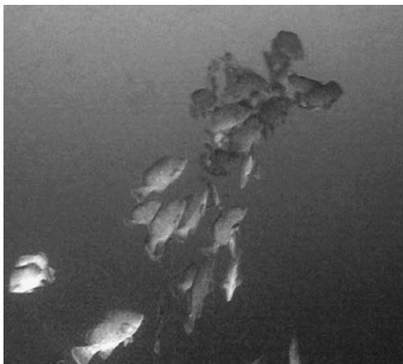
Fig. 3 Spawning rush of Leather Bass, Dermatolepis dermatolepis , at Cocos Island, Costa Rica

was observed on all dives that occurred at 13:00 h or later. Spawning events were observed on all dives that were performed from 16:00 to 18:30 h, and they occurred at depths of 40–50 m. The progression of behaviors during courtship was similar to those described above (Fig. 4), and spawning events included 10–32 fish. Individuals in the aggregations ranged in total length from 40 to 90 cm.