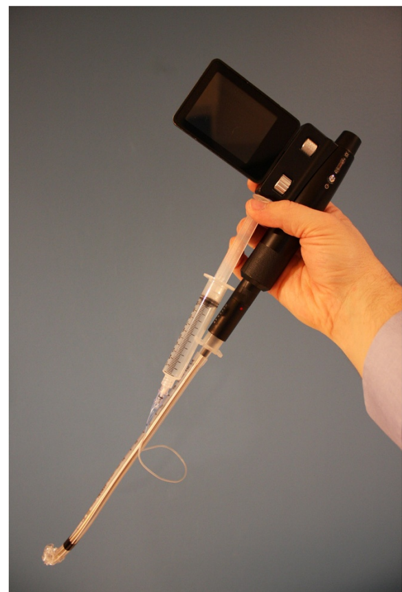
Figure 2 Endotracheal tube in position over the CVS.

utilizing the CVS alone (without the use of a laryngoscope) was given describing a midline approach with the device. Alternative approaches to the use of the CVS were not discussed. During the practice period the mannequin was set to simulate an apneic patient with normal airway, and no restrictions were imposed upon technique or positioning of the head or neck. For the data collection phase of the study, the mannequin was then placed in a c-collar and set to simulate an apneic patient with an edematous tongue, posterior pharyngeal swelling, and trismus. Random selection was used to determine which technique would be used first by each participant. Each EP was given up to three attempts to intubate with each technique. The attempts were timed from picking up the device until the stylet (either the CVS or a standard malleable stylet) was removed from the endotracheal tube (ETT) in the mannequin. Location of the ETT after each attempt was confirmed utilizing the CVS to visualize the larynx after both techniques (Figure 3). When the EP was successful with either technique, they then utilized the other technique. If unsuccessful after three attempts with either device, the EP was instructed to move to the other technique. After completion of the intubation attempts, EPs were asked to complete a demographic and survey form. They rated