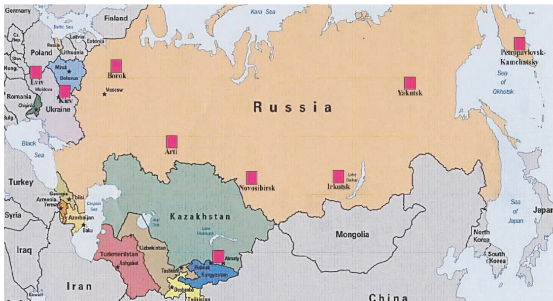
Fig. 1. Magnetic observatories targeted by the CRENEGON INTAS infrastructure action.