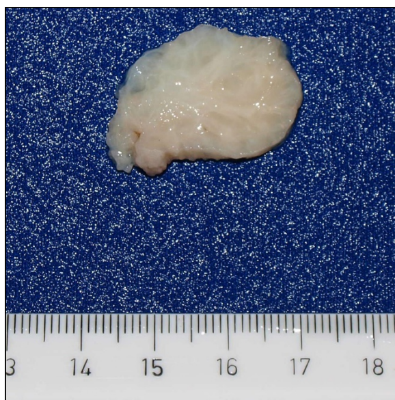
Figure 2 Appearance of cut surface of the right scrotum. A nodular tumour with a whorling surface can be seen.

After excision, the tumour tissue was sent to the department of pathology for histological examination. In macroscopical examination a solid round nonencapsulated whorling tumour of white colour and a mass of 5 x 3,5x 3.5 cm was seen (Figure 2). The testis and epididymis were not involved. Microscopically, the tumour is composed of interlacing and whorling bundles of smooth muscle cells. In these smooth muscle cells vascular channels are seen (Figure 3 A+B). The tumour cells are spindle-shaped containing a centrally located nucleus and showing no mitotic activity or nuclear atypia.