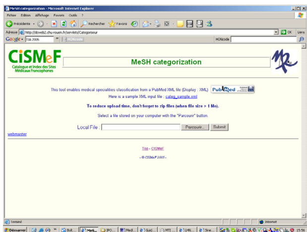
Figure 2 the MEDLINE Categorization Web site's Home Page.