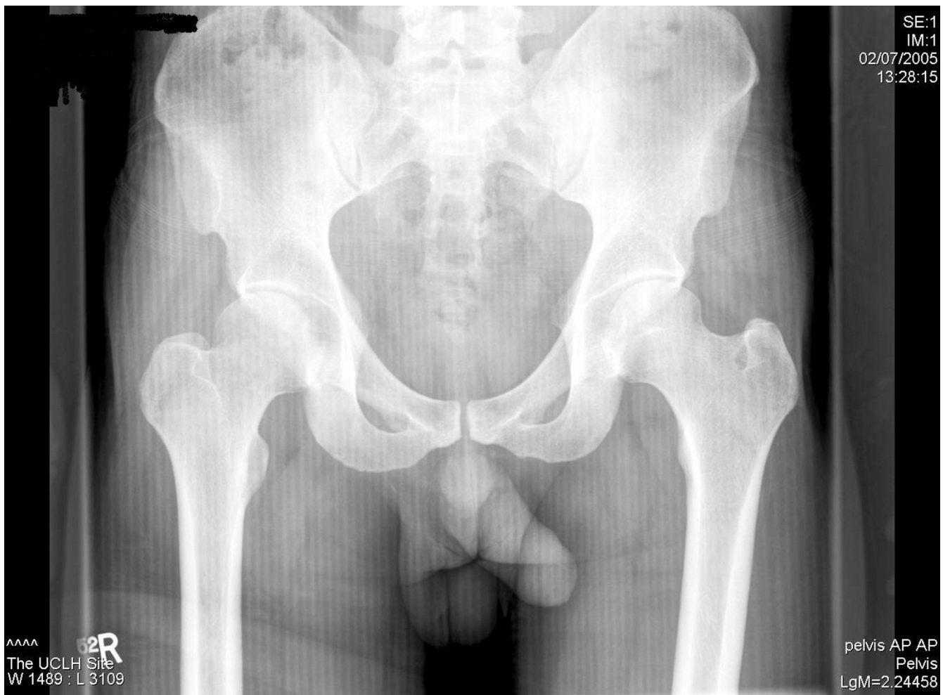
Figure 1 X-ray of the pelvis showing no positive findings.

Our working diagnosis was septic arthritis, with tuberculosis of the hip as a differential, in view of his past medical history. He was thus managed accordingly with a washout and commenced on chemotherapy. Microbiology of the synovial fluid revealed no organisms; auramine tests were repeatedly negative, as was syphilis serology, Human Immunodeficiency Virus (HIV), Hepatitis and melioidosis.