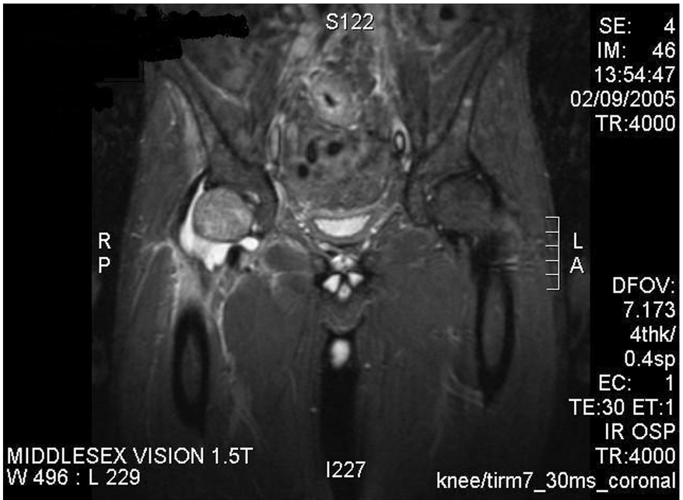
Figure 2 MRI of the pelvis showing effusion with soft tissue swelling and synovial thickening.

There was little clinical response to treatment and inflammatory markers 2 weeks after admission were elevated at a CRP of 130 and ESR of 114.