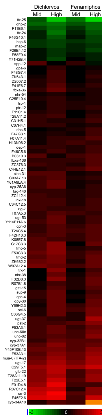
Figure 2 Changes in expression levels of genes specifically affected by OP exposure. Heatmap depicting the average changes in expression levels of genes affected by OP exposure. Gene or sequence names are shown at the left of the heatmap. The color bar indicates log 2 differences from the control for each chemical. Concentrations are based on SVM predictions.

The digested peptides were desalted, dried under vacuum, reconstituted in 10% acetonitrile, and fractionated using mixed mode ion chromatography with a Polycat A column and Polywax LP column in series (PolyLC Inc., Columbia, MD). Eight time based fractions were collected. Each fraction was analyzed using a nanoACQUITY UPLC coupled to a QTOF Premier quadrupole, orthogonal acceleration time-of-flight tandem mass spectrometer (Waters, Milford, MA). Data were collected over the 50–1990 mass to charge ( m/z ) range using the Waters Protein Expression MS E method, which alternates between low energy scans to survey the precursor ions and high colli-