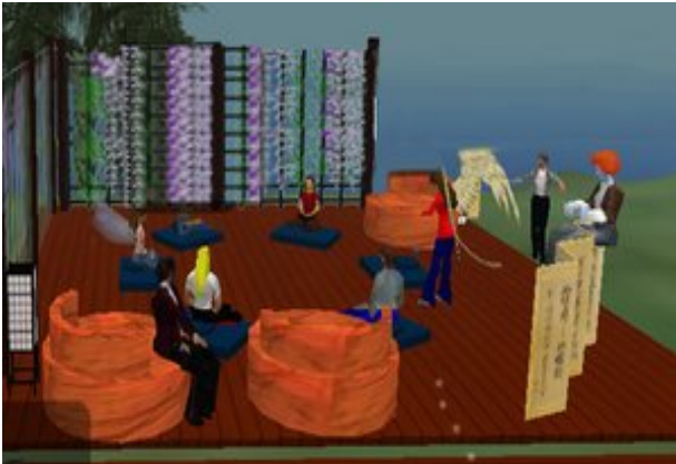
Fig. 1 Avatars in a 3D space engaged in a philosophy and ethics discussion.

worlds support the creation of constructivist learning environments ; [8], [10]. Research into purely text-based virtual worlds has found they too can ‘promote an interactive style of learning, opportunities for collaboration, and meaningful engagement across time and space, both within and across classrooms’ [11]. Visual representations of ‘in-world’ activities supply have additional affordances which support a constructivist paradigm of learning and ‘highly cooperative learning activities’ [6].