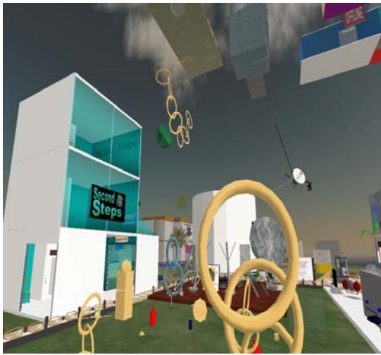
Fig. 2 Schome Park's area for carrying out physics experiments.