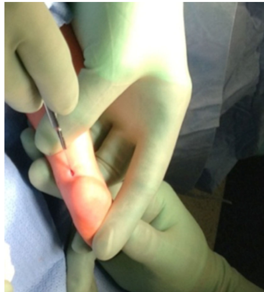
Fig. 2 Small incision of the mini-open Achilles tenotomy. Incision made over the medial edge of the Achilles tendon

Forty-one patients underwent 63 TALs via a mini-open technique in day surgery. Twelve were right-sided, seven were left-sided, and 22 were bilateral TAL. The average Pirani score was 5.8 prior to casting (range 2–6). Pirani scoring consists of six components, each scored 0, 0.5, or 1, depending on severity, for a maximal score of 6 (Table 1). The average number of casts applied prior to surgery was