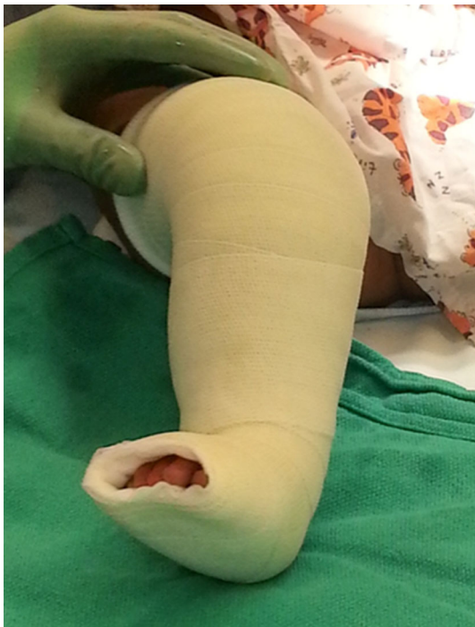
Fig. 5 A long leg cast is applied for 4 weeks