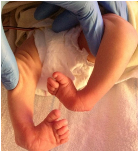
Fig. 1 Bilateral clubfoot in a newborn child

present study had idiopathic clubfoot and excluded patients with any syndromic stigmata (Fig. 1). Patients undergoing TAL for toe walking or reasons other than clubfoot were excluded. A TAL was performed if the foot could not be dorsiflexed to 5^\circ prior to application of the final cast. Sterile prep and drape was utilized. A time out was done. No tourniquet was utilized. The foot was maximally dorsiflexed and the distal portion of the Achilles tendon was palpated under the skin. A 10-mm incision was made along the medial edge of the tendon 1 cm above the calcaneus (Fig. 2). The Achilles tendon was identified. A mosquito clamp was placed beneath the Achilles tendon from medial to lateral to isolate and tenotomize the tendon (Figs. 3 and 4). After tenotomy, an increase in dorsiflexion to greater than 5^\circ was observed in all patients. Local anesthetic 2 ml of 0.25 % bupivacaine HCl with 1:200,000 epinephrine was injected. The skin was closed 4–0 Monocryl. A long leg cast was applied for 4 weeks (Fig. 5). One patient in the present study underwent a caudal block at the preference of the anesthesiologist. All other patients received general anesthesia and local anesthetic.