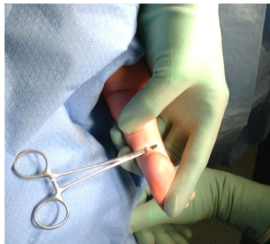
Fig. 3 A small hemostat used to deliver the tendon from the wound for direct visualization prior to tenotomy

5.8, with a range of 3–10 casts applied. The average age at the time of the TAL was 12.5 weeks, with a range of 5–48 weeks. The average weight at the time of surgery was 7.3 kg, with a range of 3.6–13 kg. The average time in the day surgery unit was 5.2 h, with a range from 3 to 16 h (Table 2). No child had a delay in discharge or stayed overnight in the hospital. All children were prescribed acetaminophen upon discharge. No post-discharge phone calls were received from the families. No patient demonstrated an anesthetic-related complication, such as death, aspiration, arrhythmia, laryngeal spasm, or bronchospasm. No nerve injuries or vascular injuries occurred. No child needed a repeated TAL due to an incomplete tenotomy.