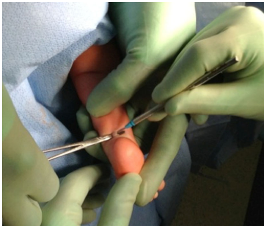
Fig. 4 Tenotomy then performed only after direct visualization obtained