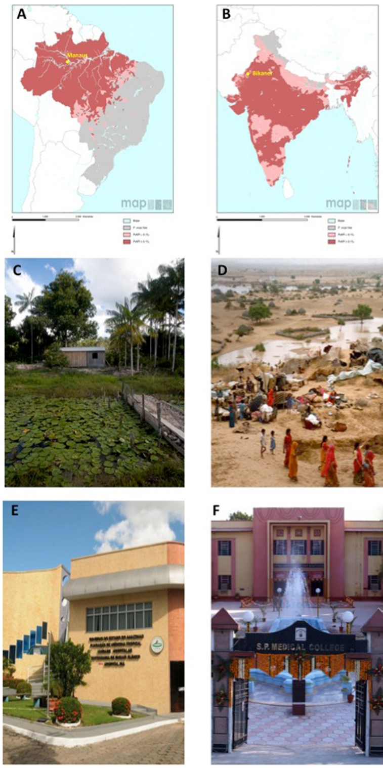
Figure 1 Epidemiological profile of the two studied sites: P. vivax 2010 annual parasite index in Brazil (A) and India (B) (reproduced from the Malaria Atlas Project [8]); malaria transmission scenarios in the rainforest, Manaus, Brazil (C) and in the desert, Bikaner, India (D); reference tertiary care center façades in Manaus (E) and Bikaner (F).