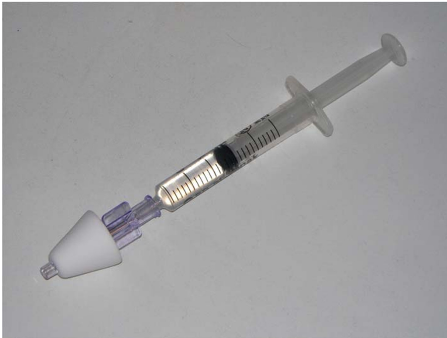
Figure 1 The Mucosal Atomiser Device (MAD) used to deliver medications via a fine spray in the nasal cavity.