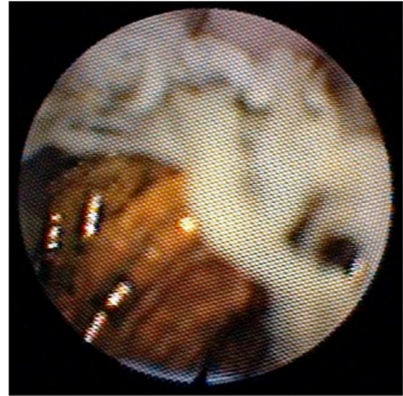
Figure 4 Coils seen around hepaticojejunostomy from within Roux limb on choledochoscopy.

Thus, approximately 10 months after his BD reconstruction, he was admitted electively for percutaneous transhepatic cholangiography (PTC) and balloon dilatation of this bilio-enteric anastomosis. After confirmation of the stricture by PTC, a 4 French catheter was inserted into his left ductal system and an 8.5 French pigtail catheter was placed into his right ductal system but neither could be advanced into the enteric limb (Figure 3). Two further attempts were made at PTC balloon dilatation, but both failed. It was decided to attempt to visualise the anastomosis through the Terblanche access limb. Choledochoscopy through the modified Terblanche access limb showed multiple radiological coils from the previous embolisation of the RHA pseudoaneurysm at the site of the anastomoses, causing a mechanical obstruction (Figure 4, Figure 5). Laparotomy was performed