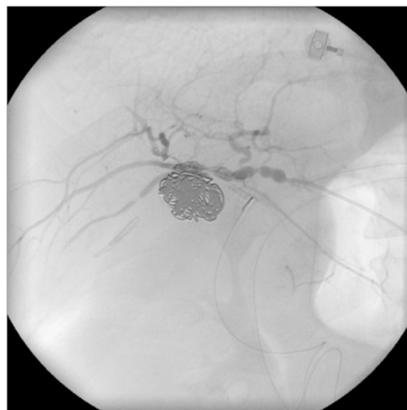
Figure 2 Coil embolisation of right hepatic arterial pseudoaneurysm.

A magnetic resonance cholangiopancreatography (MRCP) was performed, showing slight prominence of the intrahepatic biliary radicles above the level of the right and left main hepatic ducts, with preservation of