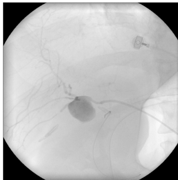
Figure 1 Pseudoaneurysm of the right hepatic artery on angiogram.

Two days following this discharge, the patient had an episode of haematochezia associated with collapse at home. He was taken to the emergency department of our hospital where he was hypotensive (blood pressure 92/63 mmHg) and tachycardic (heart rate 115 beats/min). His abdomen was soft and non-tender, and digital rectal examination revealed dark red blood. His haemoglobin level was 111 g/L. He was initially resuscitated with crystalloids, but had further episodes of fresh rectal bleeding. Repeat haemoglobin was 58 g/L, and packed red blood cell transfusion was commenced. Urgent selective computed tomography angiography was performed revealing a 2 × 2 centimetre aneurysm arising from the RHA/cystic artery adjacent to surgical clips. The aneurysm was embolised with platinum and stainless steel radiological coils (Figure 1, Figure 2). A tubogram through the biliary stents after the procedure showed no evidence of leakage or stricture of the biliary anastomoses. He had no further bleeding and was discharged three days later. Four weeks later, the stents were removed in the outpatient rooms.