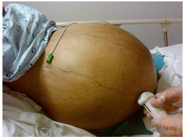
Fig. 1 Patient's abdomen revealing massive distention and spider angiomata

An 86-year-old woman presented via ambulance to the Emergency Department after falling and being unable to get up. She reported progressive abdominal distention and weight gain over the past several years, and stated that the weight of her abdomen had prevented her from standing up after her fall. She denied pain of any kind, but did report increasing dyspnea on exertion over the last few weeks. Physical findings included massive abdominal distention with spider angiomata (Fig. 1), decreased bowel sounds, and no tenderness to palpation. While considering a diagnostic and therapeutic paracentesis, the treating physician