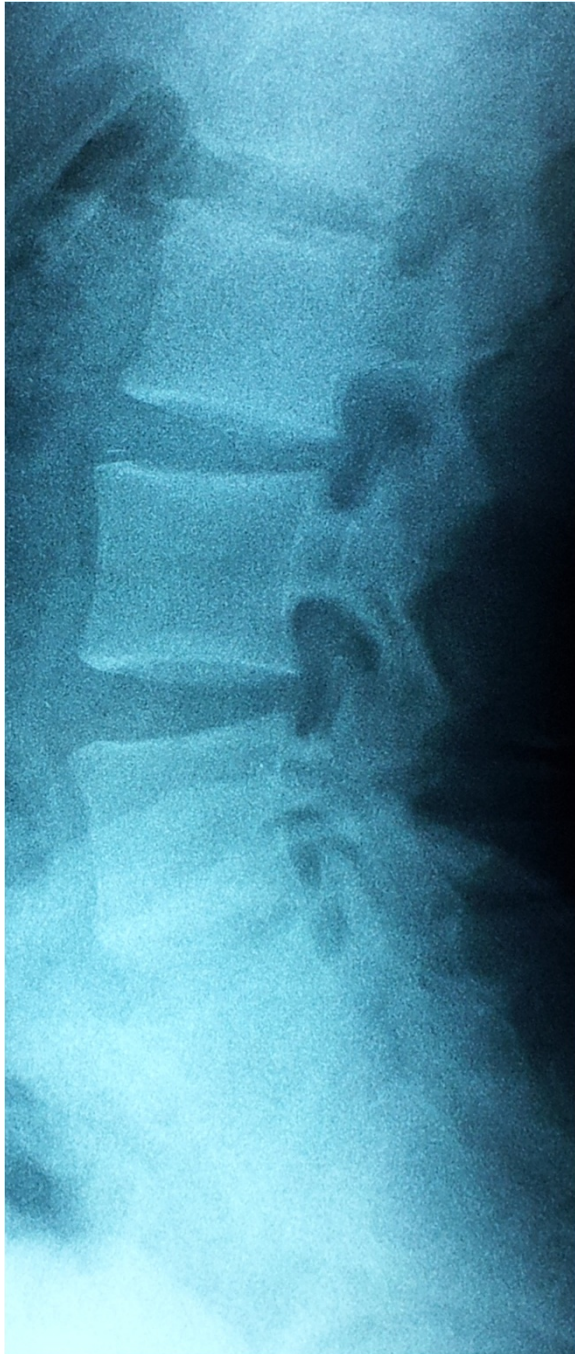
Figure 1 Plain X-ray of lumbar spine showing squaring of the lumbar vertebrae.

SwS remains a rare condition that can be drug induced (lithium, furosemide, oral contraceptives, trimethoprim-sulfamethoxazole, and so on) or associated with other pathologies, including infections in 20 to 30% of cases (bacterial, viral infections), malignancies in 10 to 20% of cases (hematological disorders in 75% of cases especially acute myelogenous leukemia, solid tumors in 35%, such as carcinomas of the genitourinary organs, breast, thyroid, and gastrointestinal tract), and chronic inflammatory disorders in 10 to 20% of cases (rheumatoid arthritis,