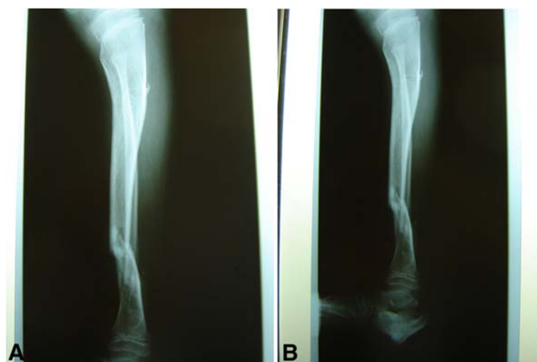
Figure 5 (a,b) Consolidated fracture of the lower extremity four months after primary operation (anterior-posterior and axial) and an incidental finding of a large bone cyst at the distal fibular metaphysis.

Written informed consent was obtained from the patient's parents for publication of this case report and accompanying images. A copy of the written consent is available for review by the Editor-in-Chief of this journal.