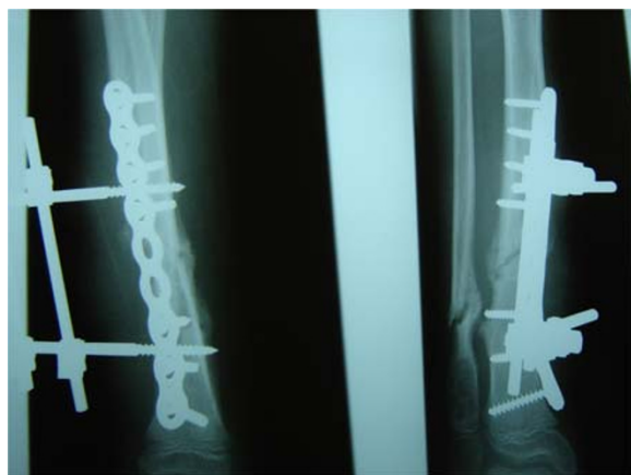
Figure 3 (a,b) Infected non-union of the fracture three months after primary osteosynthesis (anterior-posterior and axial).

This case highlights the necessity of the salvage procedures available to the orthopedic surgeon for the treatment of post-operative complications. A recommendation for a single best treatment in case of a neuropathy cannot be made, and treatment must be decided individually. A therapy regime in children with neuropathy must include stabilization of the fracture with closure of the soft tissue damage, allowing the possibility of normal wound healing and potential full weight-bearing on the extremity. A standard therapy does not currently exist, and often two or three therapy strategies must be combined. It remains to be determined whether the primary use of an Ilizarov fixateur as the definitive treatment in the case of an open fracture of the tibia combined with a pre-existing neuropathy is the treatment of choice.