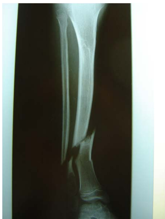
Figure 1 Grade I dislocated open fracture of the lower extremity (anterior-posterior).

external fixateur. Extensive wound dressing and coverage of the external fixateur with cotton wool did not fully protect the wound. As expected, she was re-admitted three months later with a wound infection. Plain radiographs showed a mal-union of the tibia fracture (Figures 3a and 3b), and microbiological analysis confirmed an infection with cefuroxime-sensitive Staphylococcus aureus . Intravenous antibiotic therapy with cefuroxime was initiated. Because of the mal-union, the plate osteosynthesis was exchanged for an Ilizarov external fixateur (Figures 4a and 4b), which allowed full weight-bearing of the extremity and ensured the stability of the fracture. After surgery, a pin infection of the external fixateur with a local subcutaneous abscess was observed and wound debridement with implantation of a gentamycin-impregnated sponge was undertaken. The antibiotic therapy was continued for six weeks.