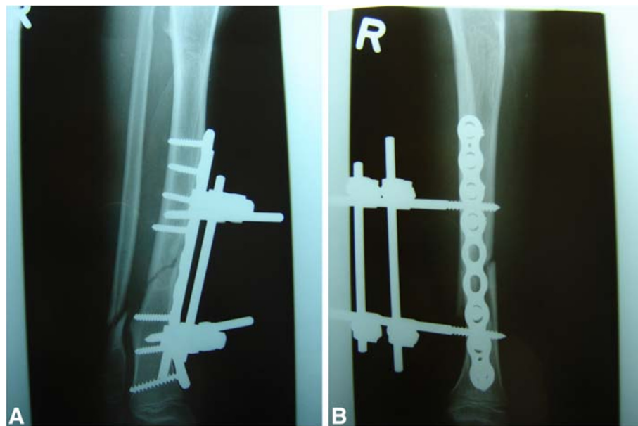
Figure 2 (a,b) Post-operative plain radiograph of the lower extremity after osteosynthesis and application of an external fixateur (anterior-posterior and axial).

recurvation of 7°, and translation to lateral-posterior to close the soft tissue damage. The mean wearing time was 12 weeks [4]. In these studies, many of the patients had massive tissue damage with post-operative malpositioning or shortening of the tibia. Thus, TSF was used as a possible treatment option to correct secondary deformities.