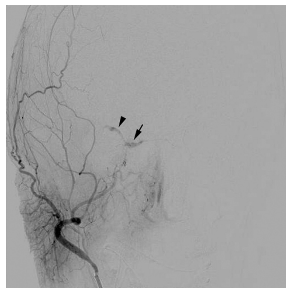
Figure 1 Cerebral angiogram showing a small indirect Barrow type D right carotid cavernous fistula. Selective injection of the external carotid artery demonstrates filling of the cavernous sinus (arrow) and retrograde drainage into the right superior ophthalmic vein (arrowhead).

One month later, our patient developed worsening vision and was noted to have a choroidal detachment OD (Figures 2A and B). She declined further angiographic