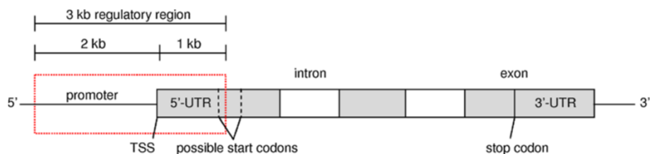
Figure 1 Location of the regulatory region analysed in a representative human gene. The location of the 3 kilobase (kb) regulatory region (marked by a red box) in a representative human gene screened in the creation of STaRRRT. As the length of the 5'-UTR can be markedly different among human genes, the 1 kb region downstream of the TSS will encompass the entire 5'-UTR for some but not all human genes. This is demonstrated by the marking of two possible start codons in relation to the regulatory region screened.

Downstream of the TSS, STaRRRT STRs may be located within the 5'-UTR or the coding region. We note 15,029 transcripts of the 41,007 (non-haplotype or unplaced contig) transcripts present in RefSeq (release 56 database) have 5'-UTR regions that will go beyond