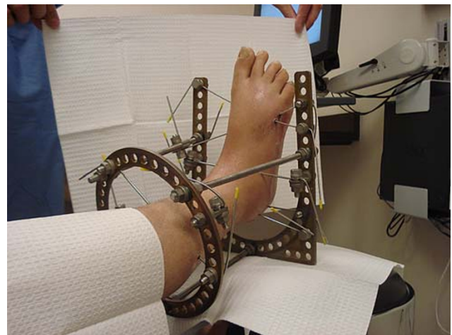
Fig. 3 LIMA frame

fat that fills the space between the posterior end of the subtalar joint and the sheath of the tendoachilles.