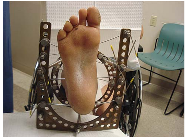
Fig. 2 LIMA frame