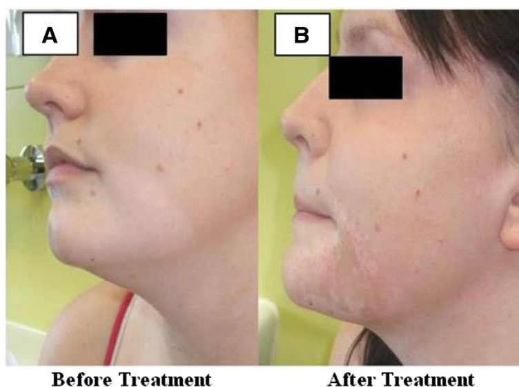
Figure 2 A set of 'before' and 'after' images showing hyperpigmentation used in the online discussion groups. A set of 'before' and 'after' images showing hyperpigmentation used in the online discussion groups. This set of images consent was gained from the individual seen in Figure 2 for use of their images in research publications as well as was obtained from images held at the Centre of Evidence Based Dermatology of before and after treatment. Full future studies.

initial survey work showed that this term was rather unhelpful to patients, who felt that it was vague, impersonal and rather 'medical'; or it implied that vitiligo was just something to be covered up (using cosmetic camouflage).