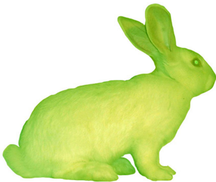
Fig. 3 Eduardo Kac, GFP Bunny , 2000.

be inspired to do something that the artist claims to have done (but probably did not do).