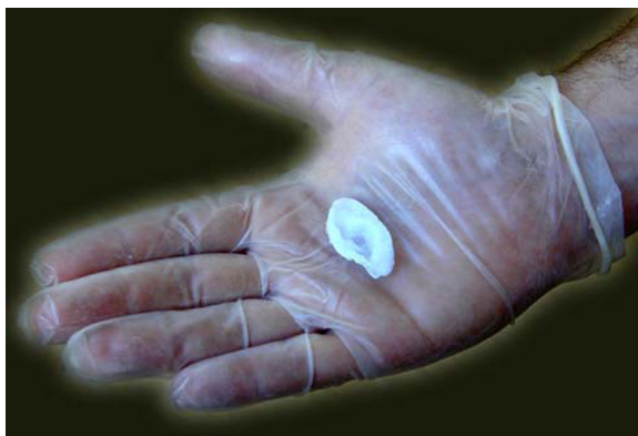
Fig. 2 Tissue Culture and Art Project, Extra Ear 1/4 Size , 2003.

The ethical importance of art has been discussed at least since the Ancient Greeks. Plato [52] was suspicious of the potential of poetry, painting and sculpture to sway people’s emotions, leading them away from the search for truth. Aristotle [3], on the other hand, emphasised the power of tragedy, in particular, to bring enlightenment through contemplation of an exemplary story. Although differing in their view of the value of art, 10 they both evaluated it from what we would call a moralist point of view.