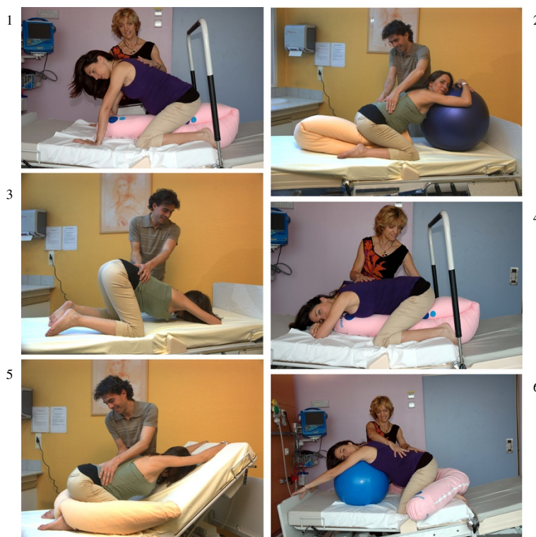
Figure 2 Six fitted hands and knees' positions*. *Consent to publish these images was obtained by Dr Bernadette de Gasquet, author of the original book [21].

implement and acceptable to women according to previous studies that evaluated the experience of similar positions [11,22]. A relative disadvantage of this technique is the organisation of equipment for the mother (infusion, epidural, electronic blood pressure) and fetus (heart monitoring). Regarding the possible effect of the hands and knees' position on the epidural anaesthesia, a French study conducted by anaesthetists showed that hyperflexion at the hips did not influence the expected epidural analgesia levels [23].