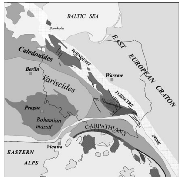
Figure 1 Tectonic sketch map of Central Europe

It was formed as a result of consecutive collisions of the smaller Gondwana-derived crustal fragments (microplates) of Avalonia and Armorica (TAIT, 1999; LEWANDOWSKI, 2003). This area, called the Trans-European Suture Zone (TESZ) (PHARAOH, 1999), intersects the European continent from the Black Sea