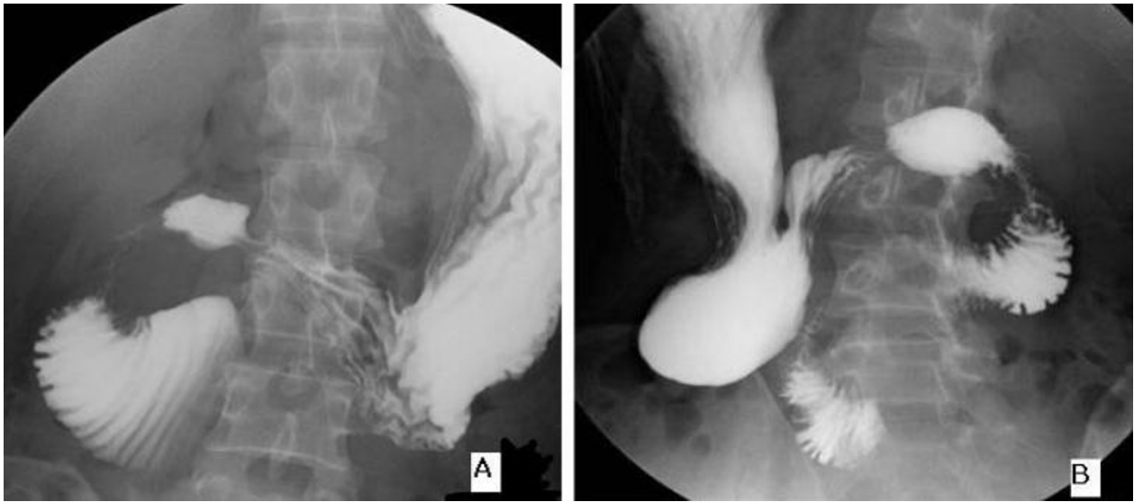
Figure 3 Upper gastrointestinal series shows: (A) Upper gastrointestinal series shows stricture of the duodenal third portion with a straight line cut-off sign in supine position. (B) In the prone position, the contrast medium passes through the obstructed part to the distal side of duodenal third portion.

An RPH represents a hernial sac entrapping the small intestine through the Waldeyer's fossa. The fossa is the first part of the mesentery of the jejunum, and is located inferior to the third portion of the duodenum and behind