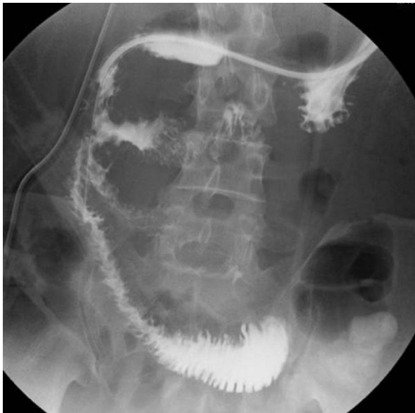
Figure 5 Post-operative upper gastrointestinal series shows good passage through the anastomosis.

the SMA to the aorta, which is the AMA, is probably wider than in the normal state. This is the reason why the surgical repair of RPH may have caused SMAS.