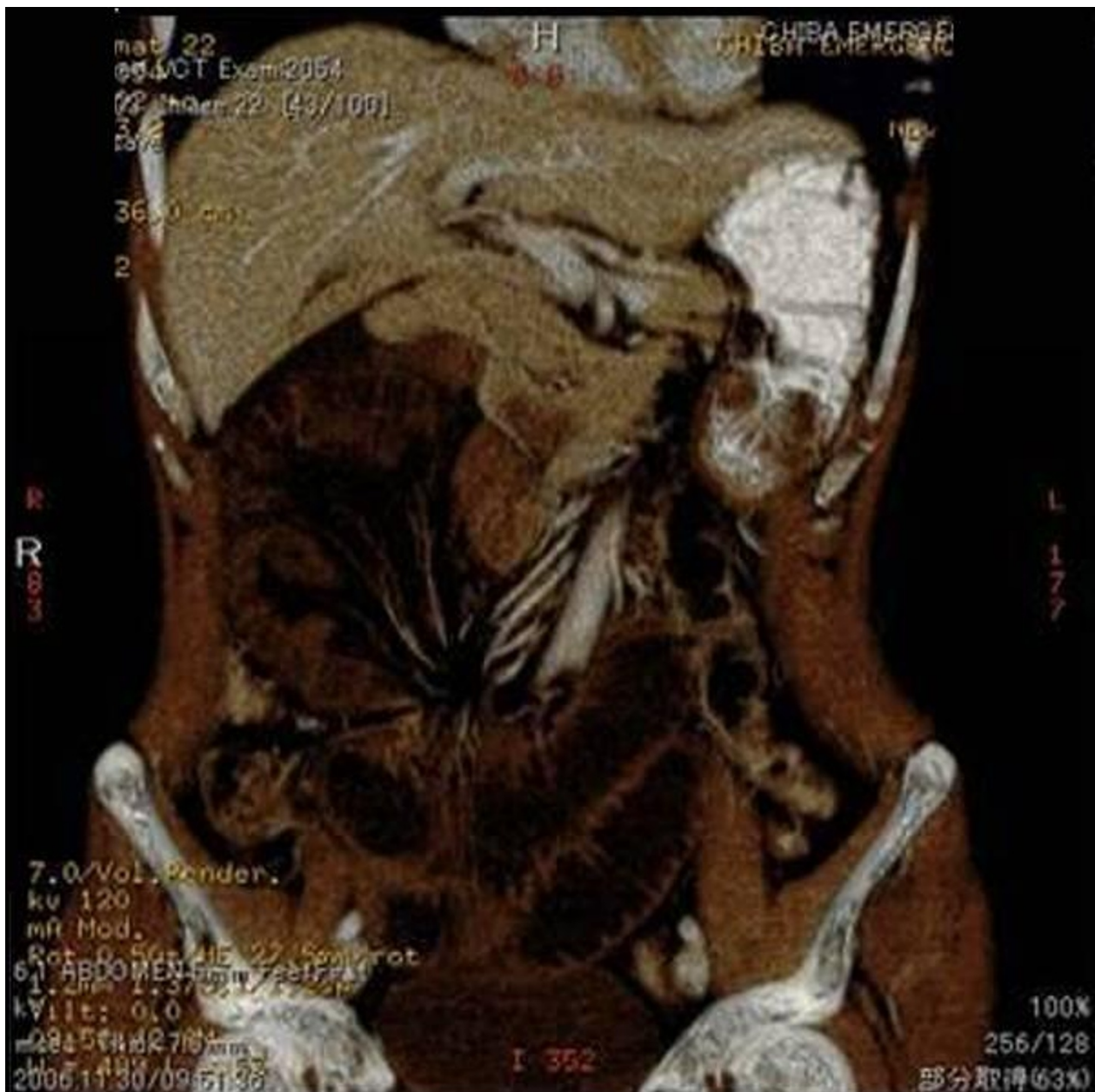
Figure 6 Retrospective multiplanar reconstructed enhanced multidetector-row computed tomography images reveal an abnormal cluster of digestive loops in the right lateral abdominal cavity and mesenteric vessel changes such as twisting and stretching.

angle. However, the post-operative enhanced MDCT revealed a narrow AMA, a short AMD, and the absence of bowel gas. We hypothesized that our patient had been suffering from RPH without complete bowel and vessel obstruction, so that the hernia cluster had kept the AMA wide. However, the repair of the hernia might have caused the AMA to narrow and squeeze the duodenal third portion, thus causing SMAS. In this case, reconstructed multiplanar images of enhanced MDCT allowed us to easily visualize and identify these diseases.