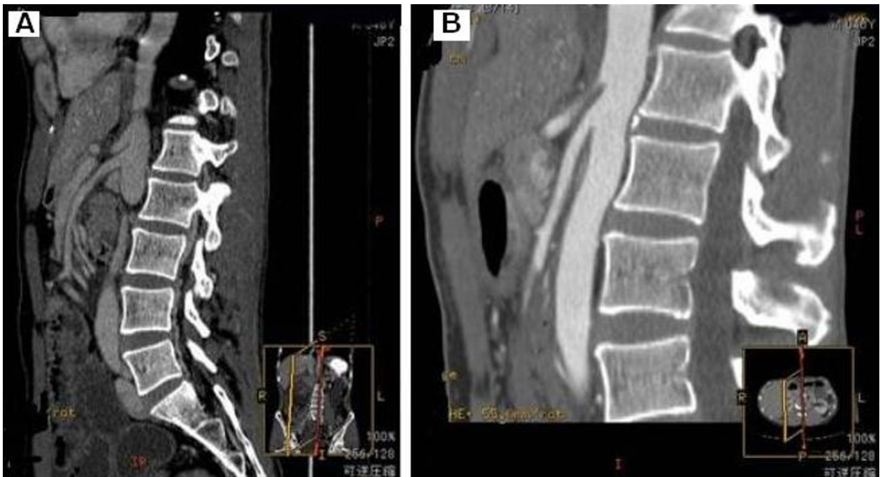
Figure 4 Reconstructed enhanced multidetector-row computed tomography reveals the following: (A) before the surgical repair of the right paraduodenal hernia, the aorto-mesenteric angle is 44^\circ , and the aorto-mesenteric distance is 28 mm. There are intestinal gas bubbles under the aorto-mesenteric junction. (B) After the repair, the aorto-mesenteric angle has narrowed to 14^\circ , and the aorto-mesenteric distance has shortened to 5 mm. Furthermore, no intestinal gas can be seen under the angle.

the superior mesenteric artery (SMA). This specific location is very important, because the bowel cluster that passes through the hernia orifice into the sac seems to lift up the SMA to a ventral position. As a result, the angle of