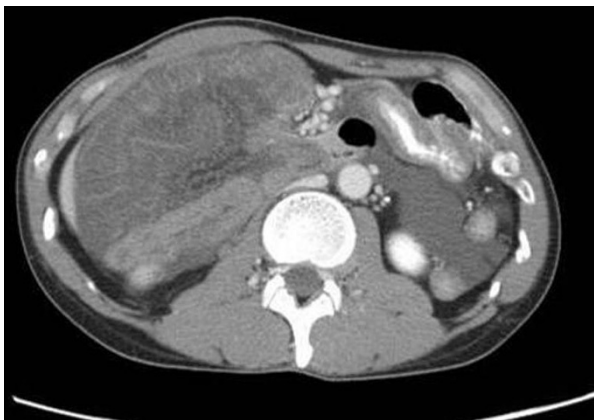
Figure 1 Pre-operative enhanced abdominal multidetector-row computed tomography shows intestinal cluster in the right lateral abdominal cavity. The intestinal wall is edematous and not well-enhanced.

An upper gastrointestinal contrast series revealed dilatation of the right side of the duodenal third portion with a straight line cut-off sign. The contrast medium did not pass to the proximal side in supine position, although it did pass with postural change to the prone position (Figure 3). SMAS was strongly suspected, and an enhanced MDCT of our patient was again performed to examine the stricture around his duodenum and SMA. A multi-